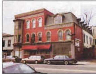
#48 520-522 Main St. Kaufman House Eclectic Style, 1879.